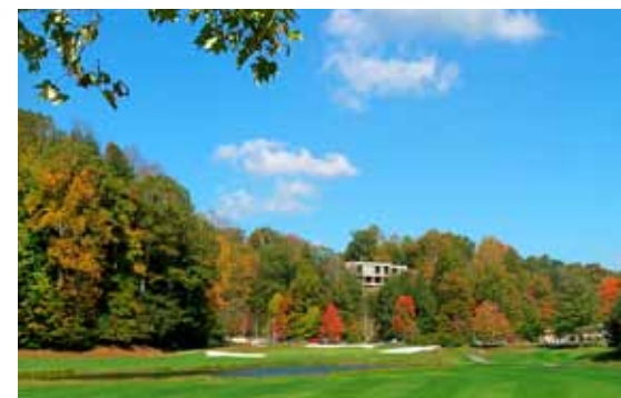
The Wyoming County EDA is located in Pineville, WV—right in the heart of beautiful southern West Virginia.