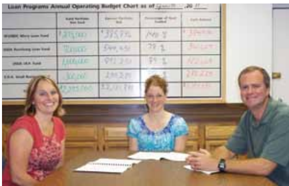
Members of Wyoming County EDA's friendly staff are on hand to answer any questions you may have.